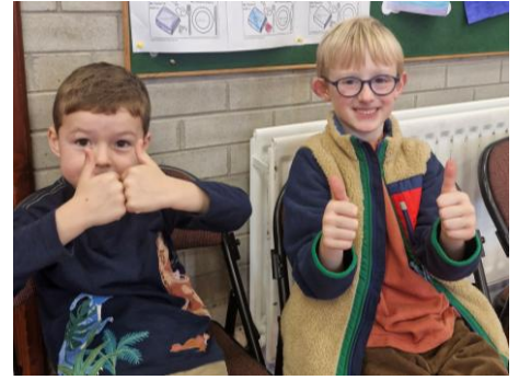
Sunday Club Leaders