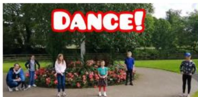
Showing off our groovy moves for the Body Parts game

We made a video for the Ripple Connor Diocese Holiday Bible Club 'Cabin Fever' in the beautiful surroundings of Houston's Mill garden. Look out for the 'Body Parts Game' on week 1. The 10 videos which premiered from 3 rd – 7 th August are still available to watch at https://www.facebook.com/watch/?v=651004409098716